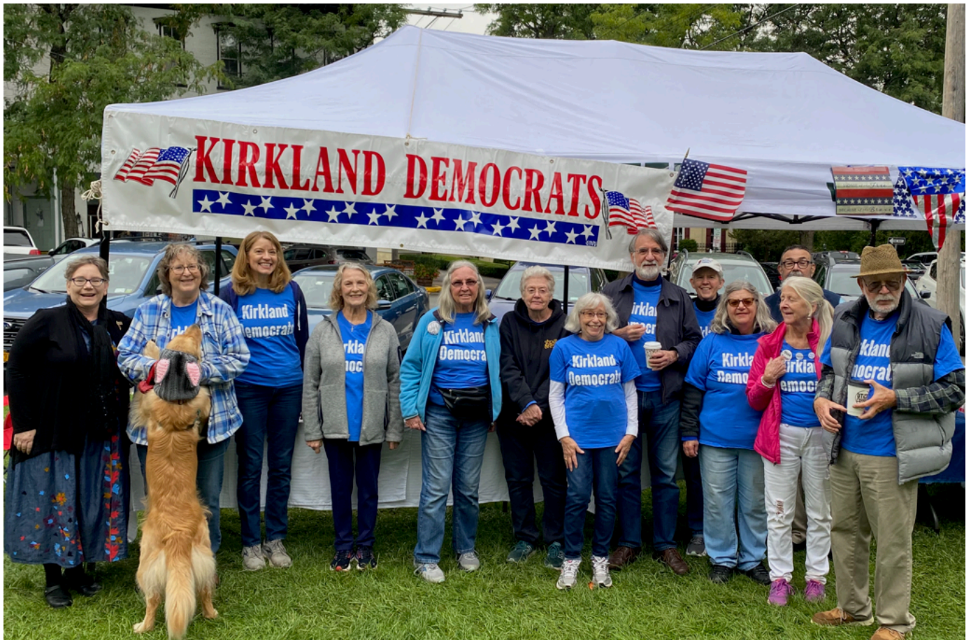
Members of the Kirkland Democratic Committee at the Gathering on the Green, September 23, 2023