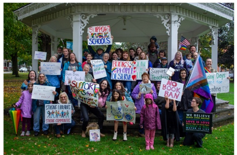
Freedom to Love & Learn rally

Attendees also had a chance to meet two of the potential candidates for next year’s Congressional