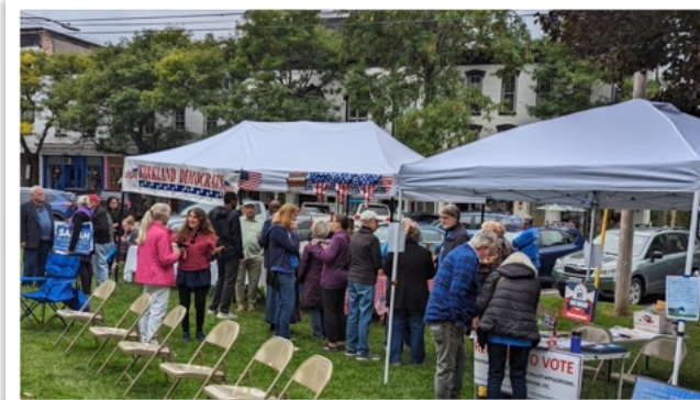
Gathering

Continuing our long-standing tradition, we held our annual Gathering on the Green on Saturday, Sept. 23, to introduce the 2023 Democratic candidates.